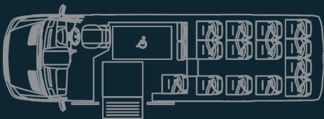
EVM COMMUNITY 16