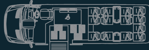
EVM CITYLINE 21 EXECUTIVE