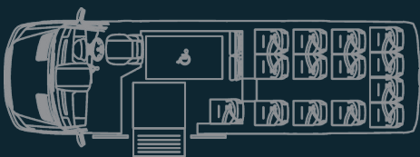
EVM COMMUNITY 16