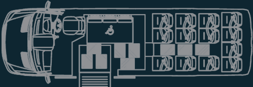
EVM CITYLINE 25