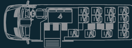
EVM CITYLINE 22